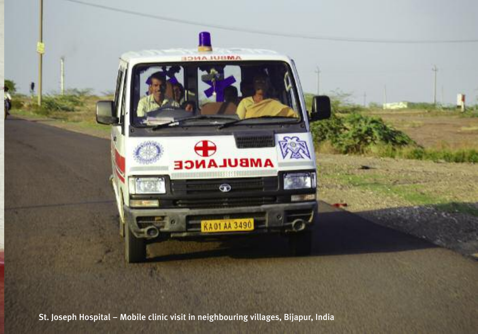
St. Joseph Hospital – Mobile clinic visit in neighbouring villages, Bijapur, India