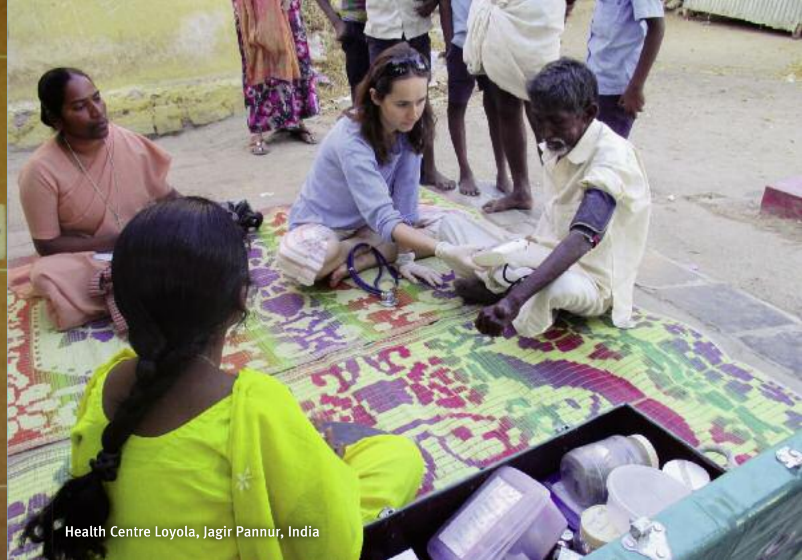
Health Centre Loyola, Jagir Pannur, India