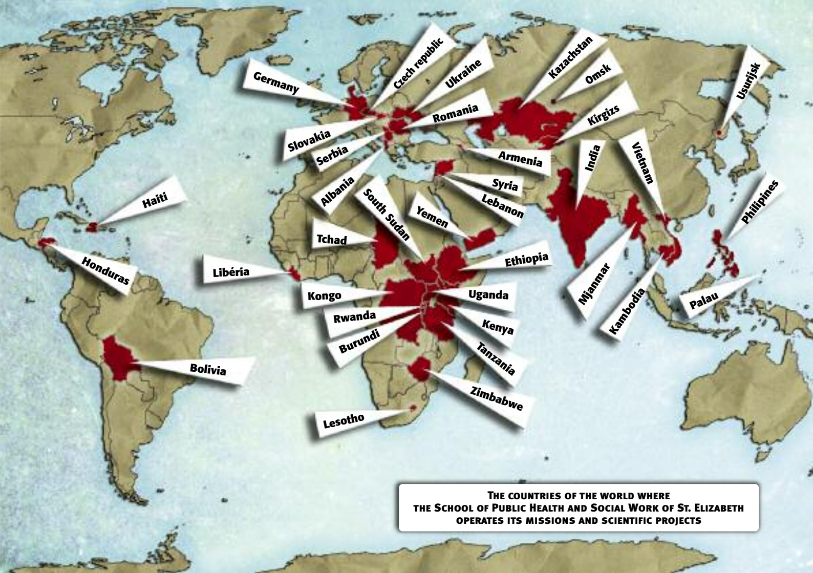
THE COUNTRIES OF THE WORLD WHERE THE SCHOOL OF PUBLIC HEALTH AND SOCIAL WORK OF ST. ELIZABETH OPERATES ITS MISSIONS AND SCIENTIFIC PROJECTS