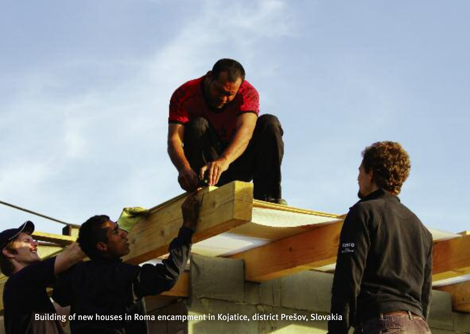
Building of new houses in Roma encampment in Kojatice, district Prešov, Slovakia