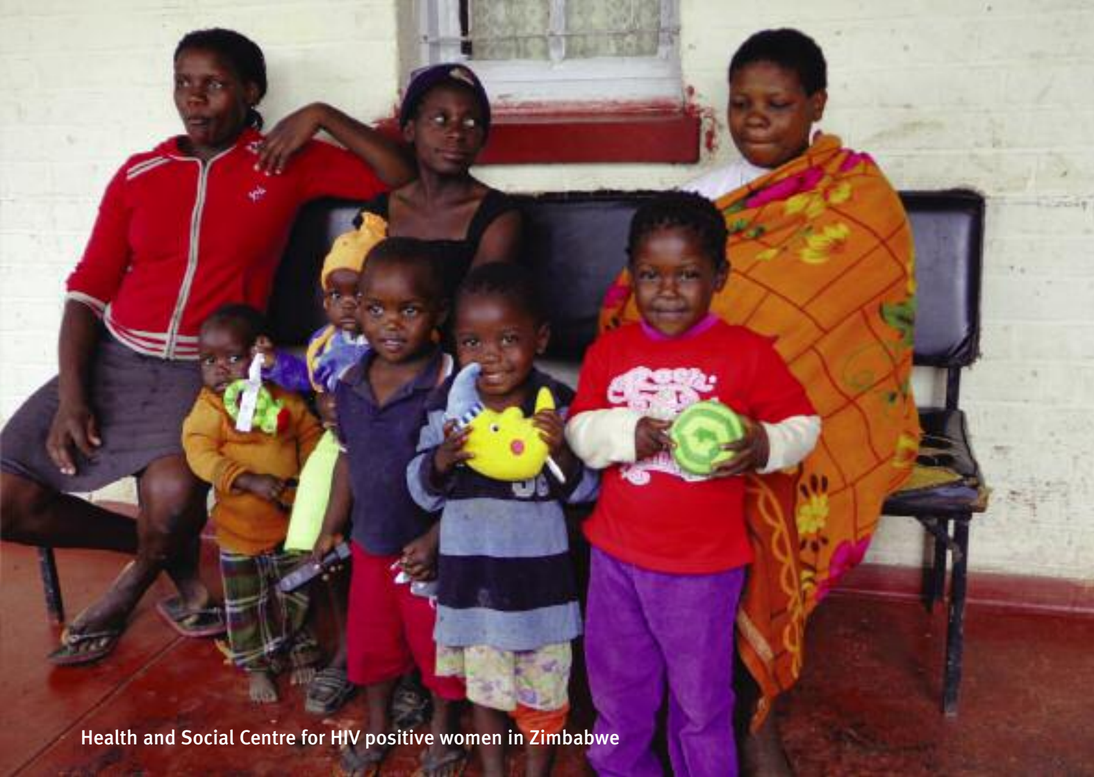
Health and Social Centre for HIV positive women in Zimbabwe