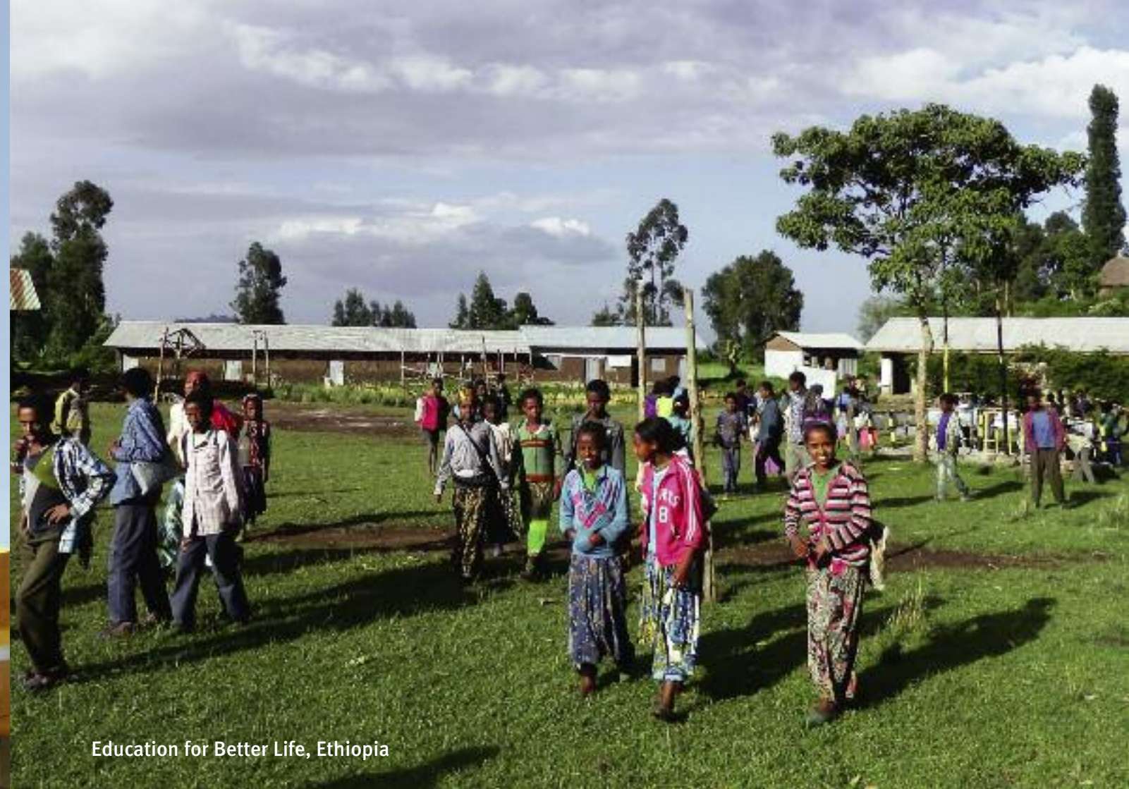
Education for Better Life, Ethiopia