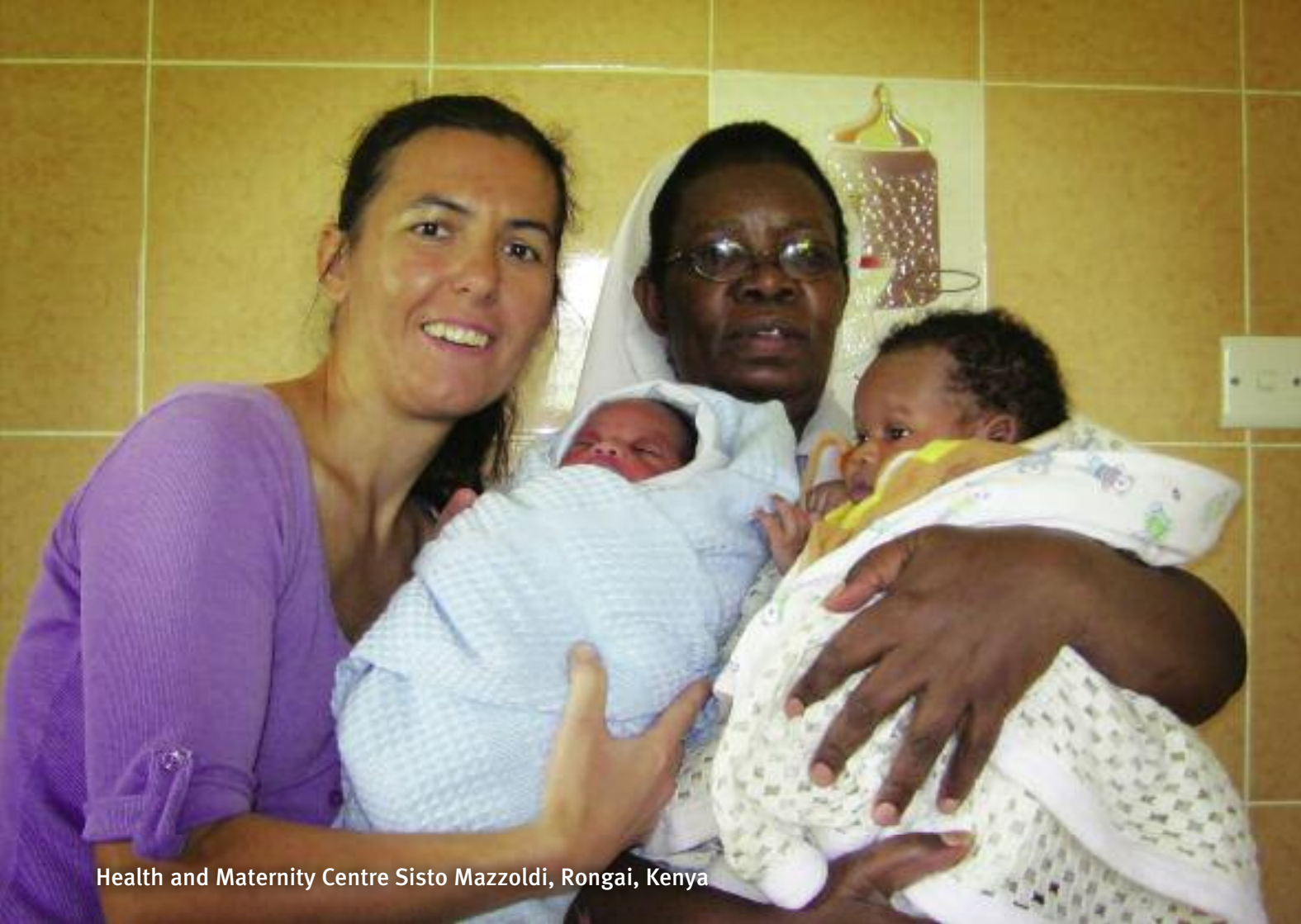
Health and Maternity Centre Sisto Mazzoldi, Rongai, Kenya